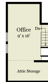
LOFT 260 SQ FT (Low Ceiling)